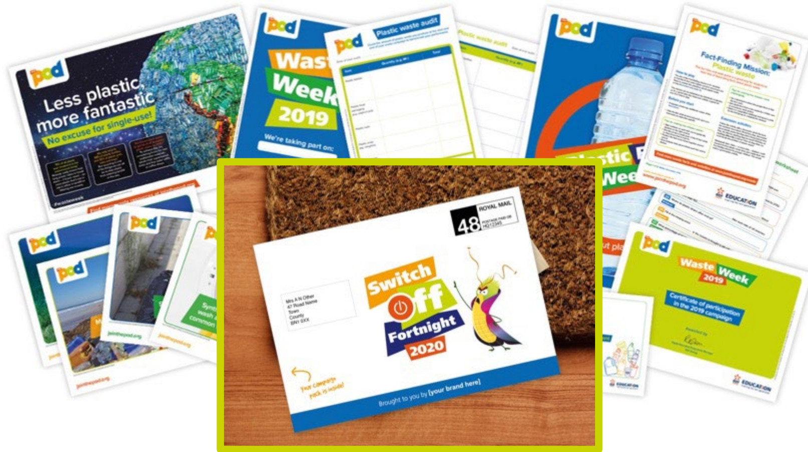
Your local authority name on our campaign pack resources and communications